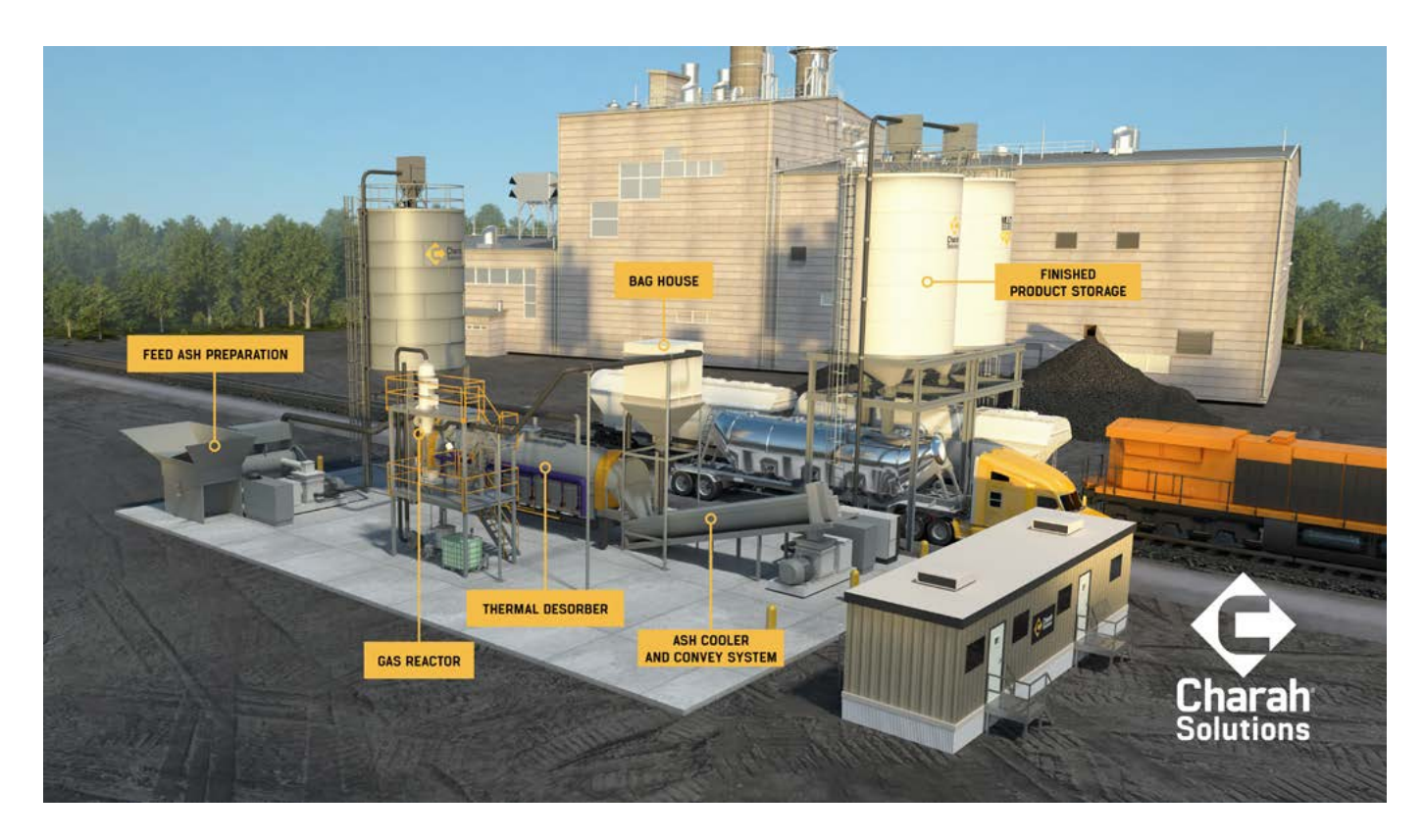
EnviroSource beneficiation technology - how it works

yield ASTM C618-quality fly ash suitable for beneficial use in ready-mix concrete and other durable/high-strength applications.